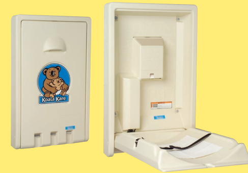
KB101 VERTICAL, WALL-MOUNTED Dimensions: 22" W x 35 1/2" H (559 x 902mm) • Depth (closed): 5 1/4" (133mm) • Extension (open): 35" (889mm) • Colors: Cream, Grey, White Granite