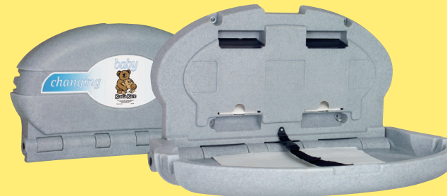
KB108 OVAL, WALL-MOUNTED Dimensions: 33 7/8" W x 20 1/2" H (860 x 521mm) • Depth (closed): 4" (102mm) • Extension (open): 20 1/2" (521mm) • Colors: Cream, Grey, Grey Granite