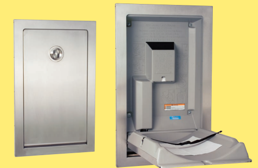
KB111-SSRE VERTICAL, SEMI-RECESSED MOUNTED Dimensions: 24 1/4" W x 39 1/2" H (616 x 1003mm) • Depth (closed): 1 1/2" (38mm) • Extension (open): 29 3/4" (756mm) • Rough Wall Opening: 22 1/2" W x 36" H (572 x 914mm) • Depth: 4" min (102mm)