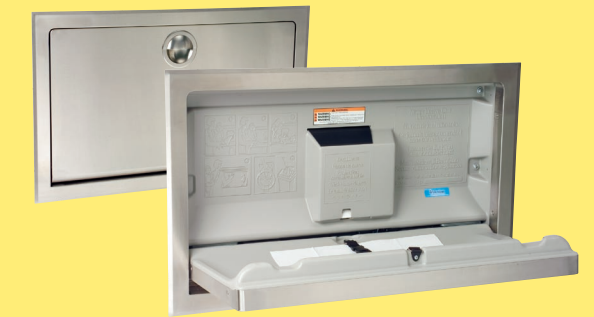
KB110-SSRE HORIZONTAL, RECESSED-MOUNTED Dimensions: 37" W x 23" H (940 x 584mm) • Depth (closed): 3/4" (20mm) • Extension (open): 15 1/4" (387mm) • Rough Wall Opening: 35 1/2" W x 20 1/2" H (900 x 529mm) • Depth: 4" min. (102mm)