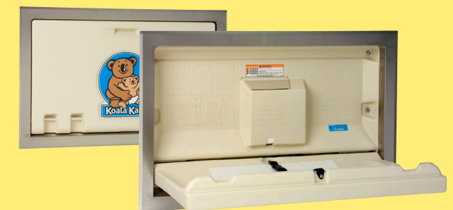
KB100-ST HORIZONTAL, RECESSED-MOUNTED WITH STAINLESS STEEL FLANGE Dimensions: 37" W x 23" H (940 x 584mm) • Depth (closed): 4" (102mm) • Extension (open): 15 1/4" (387mm) from flange • Rough Wall Opening: 35 1/2" W x 20 1/2" H (900 x 529mm) • Depth: 4" min. (102mm) • Colors: Cream, Grey, White Granite • Material: 18-gauge type 304 satin-finish stainless steel with polyethylene bed.