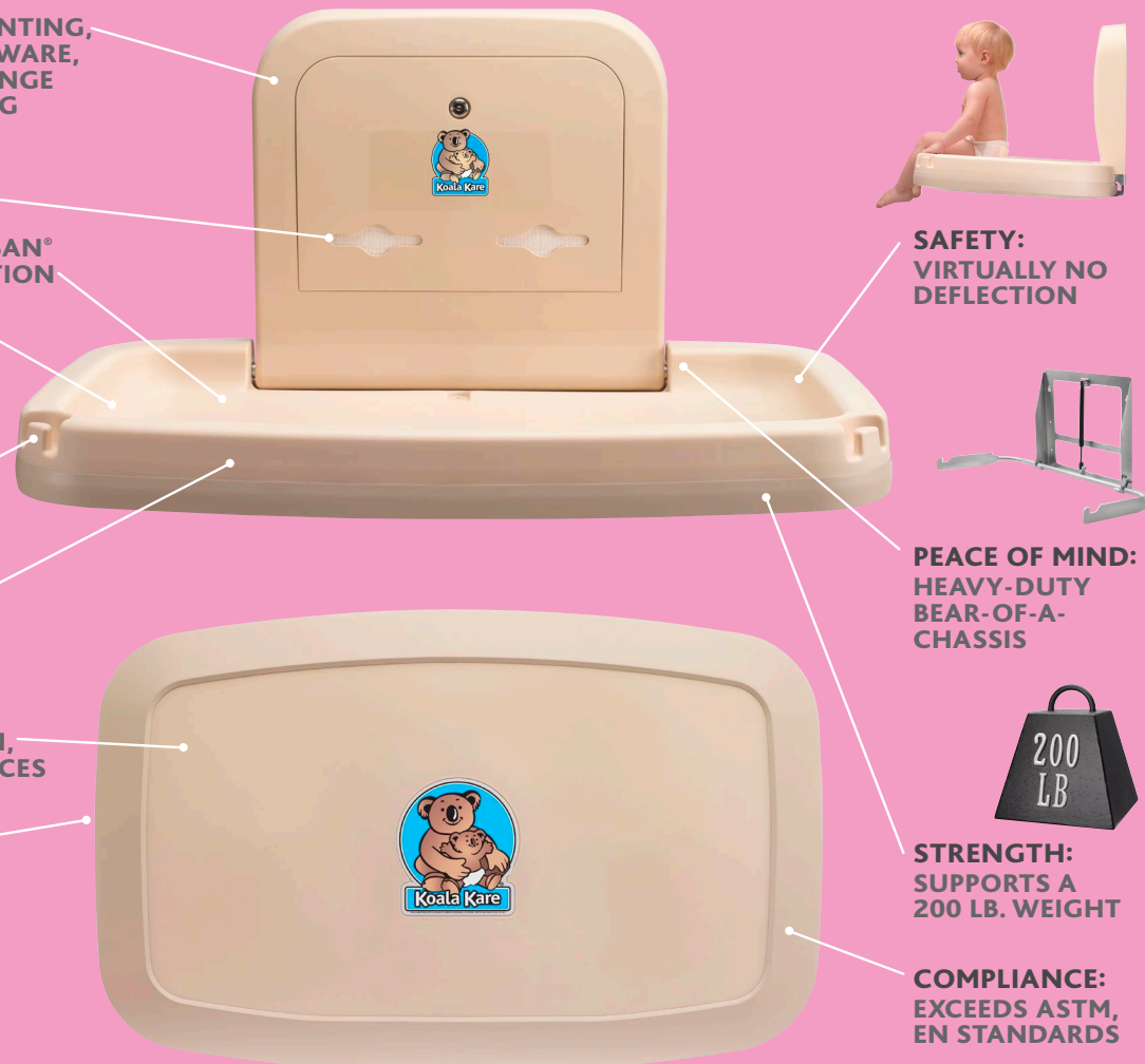
KB200 HORIZONTAL, SURFACE MOUNTED Dimensions: 35" W x 22" H (889 x 557/8mm) • Depth (closed): 4" (102mm) • Extension (open): 22 1/2" (571 1/2mm) • Colors: Cream, Grey, White Granite, Earth (new)

EASY OPERATION: SHOCK-ASSISTED OPEN AND CLOSE