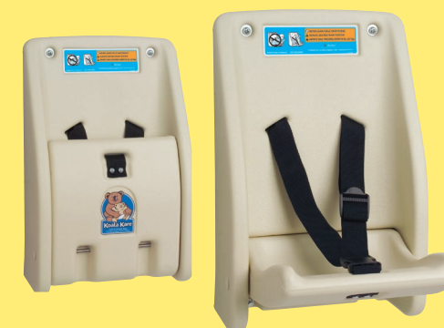
KB102 CHILD PROTECTION SEAT Dimensions: 12 1/4" W x 18 3/4" H (311 x 476mm) • Depth (closed): 5 5/8" (143mm) • Extension (open): 12 1/2" (317mm) • Colors: Cream, Grey