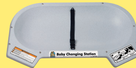
KB112-01RE RECESSED COUNTERTOP-MOUNTED Dimensions: 32" W x 19 5/8" L (812 x 497mm) • Depth: 3" (76mm) • Color: Grey Granite